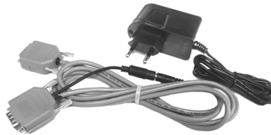
RS232 & External power adapter