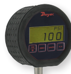
DPG-100 with protective rubber boot