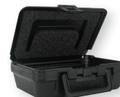
Protective carrying case