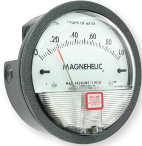
Standard Magnehelic® gage