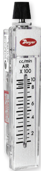
Model RMA-TMV 2" scale, 4-13/16" high